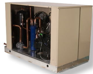
Horizontal Condensing Units 27,770 - 101,930 BTU

To better serve your expedited project needs, Heatcraft Worldwide Refrigeration is expanding its popular stocking program to include 575V condensing units .