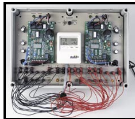
Training Seminar Trainer

Heatcraft trains service technicians to provide you with superior service if you ever need service on your Beacon® II Refrigeration System.