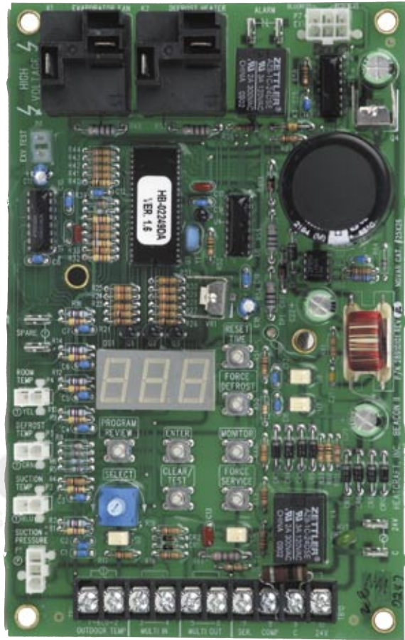
Beacon® II's Control board and electric expansion valve are factory installed for dramatically reduced field assembly time and minimal adjustments on the job site.

Beacon® II's significantly simplified installation process results in a far more reliable and efficient refrigeration system with far fewer callbacks and dramatically reduced system down time. The 24 volt control wiring is also safer, easier, and less expensive to install. All of Beacon® II's installation efficiencies mean a substantially more profitable installation for contractors and end users.