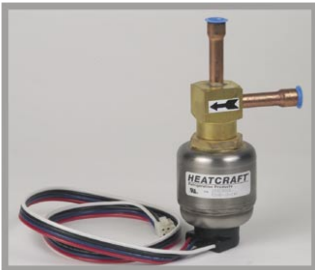
Beacon® II's electric expansion valve more accurately controls the flow of refrigerant into and out of the system. It replaces traditional expansion and solenoid valves.