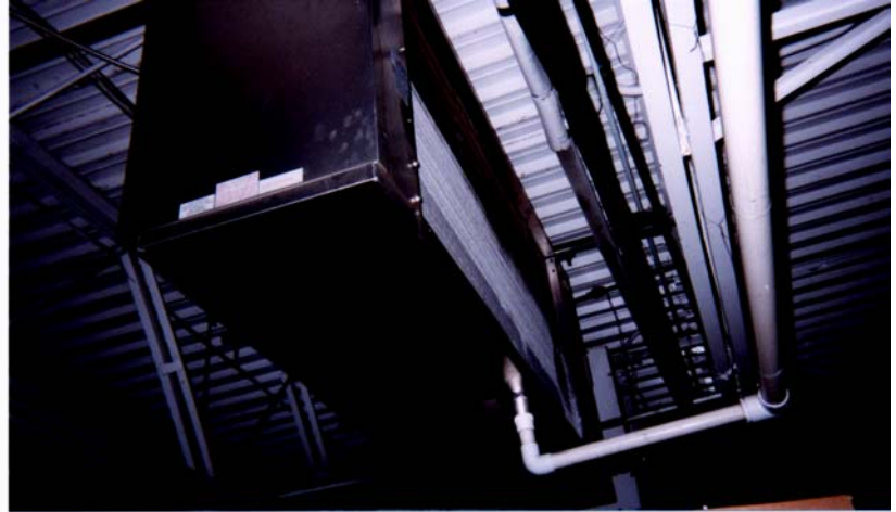
Figure 2 below shows the frosting pattern of an evaporator coil with an improperly sized nozzle.

In order to provide uniform feeding, it is important that each evaporator circuit has equal resistance therefore each distributor tube must be of equal length and pressure drop. The distributor tubes should be bent carefully. Sharp bends or kinks reduce the inside diameter of the tube causing increased resistance.